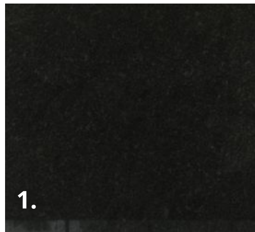
Steel Grey Polished