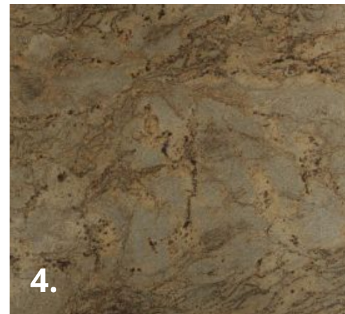
Golden Crystal Leathered