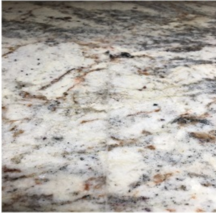
Seam in Typhoon Bordeaux

Tighter seams show less glue. The challenge is not creating a glue color, but is balancing the variety of colors in a wild varied stone into one glue that works the entire length of the seam. Allowing the customer to participate and approve the glue color BEFORE it goes into the seam is key, as "beauty is in the eye of the beholder". A tighter seam with less visible glue minimizes the visual impact of the glue in the first place!