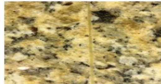
Competitors (Saw Cut) Seam

The stone itself causes this variable not the machine, blade, or tool preparing it. We have developed a proprietary technique of progressively slow sanding at higher grits and lower pressure to produce a crisper edge.