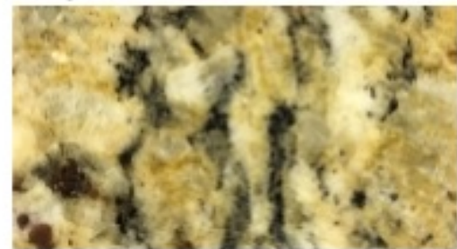
Our Proprietary Seam